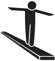
BALANCE BEAM RELAY

Every student will receive a Croc-A-Thon t-shirt to wear for the event, and families are encouraged to come cheer the students on!